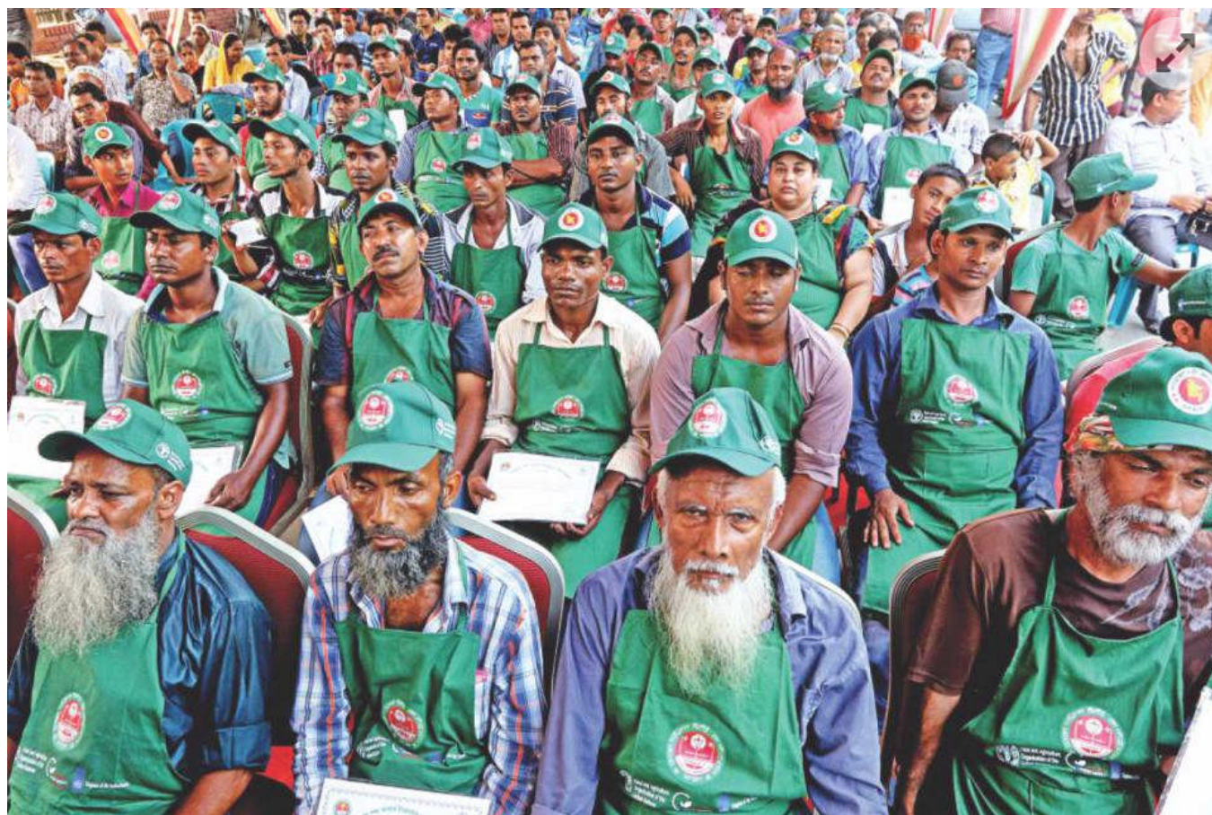
The trained vendors at yesterday's programme.

Of the total carts, 51 will be stationed at Shahbagh and the rest at Motijheel.